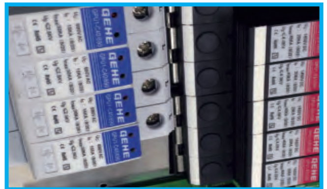
(Surge Protection Devices)

The RPI-M50A comes with built in PV fuse on both the positive and negative strings for all ten inputs. Also the inverter has Type-2 SPD's (Surge Protection Device) for both the DC (One for each MPPT) and AC inputs. Both the PV fuse and SPD's can be replaced. This can bring down the overall PV system costing.