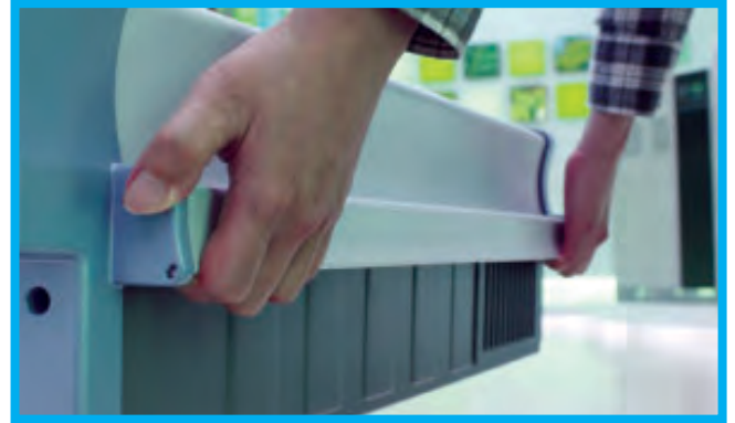
(Ergonomic Grip Design)

Ergonomic grip design gives more convenience while moving the inverter during installation. With special handle protection design, RPI-M50A can be easily placed down on the flat ground vertically without damaging various connectors at the bottom.